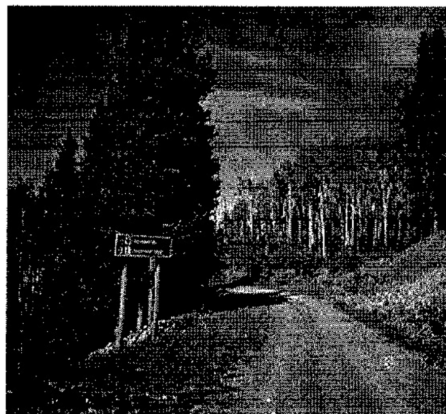
Figure 1: A typical image in the Aspen collection.

and testing image samples (different parts of the same window in the given image for training and testing, different windows in the same image, and different images).