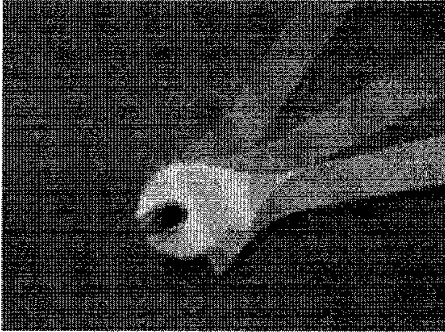
Figure 3: Tightening motion with a wrench.

other sequences [Duric et al., to appear], we used motion information to differentiate between two different functionalities of the same object: scooping and hitting with a shovel, and hammering and tightening with a wrench. These examples of double usage are typical instances of improvisation; motion provides clear information for a correct interpretation of the action that is taking place.